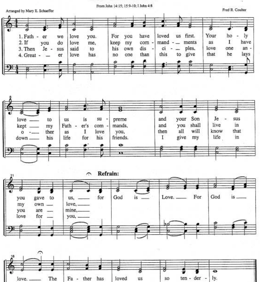
© 1997 by Christian Biblical Church of God